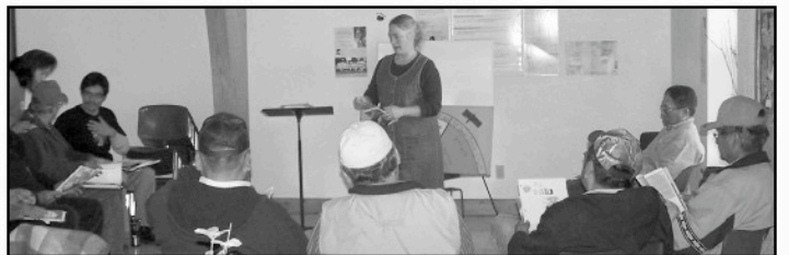
A recent LDN discussion session

motivate, encourage and enable me with GOD’s blessings in whatever role(s) the LORD GOD leads me to.”